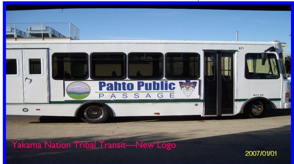
Yakama Nation Tribal Transit—New Logo

sented this information to the Tribal Council on August 7,2008. We were approved of the Logo and the new bus route that began on September 4, 2008.